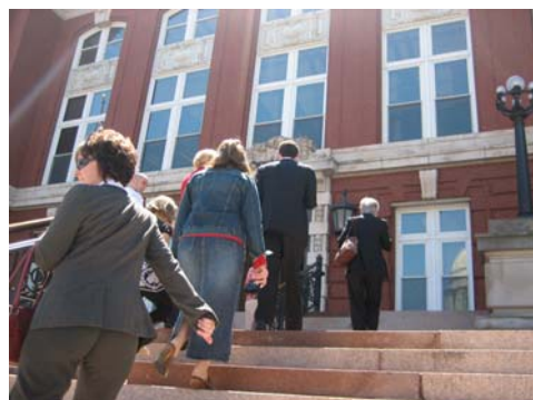
Going into Supreme Court