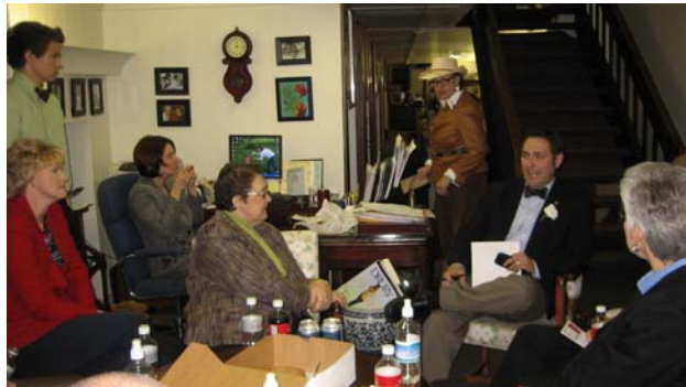
Lunch with Legislators on the Insurance Committee