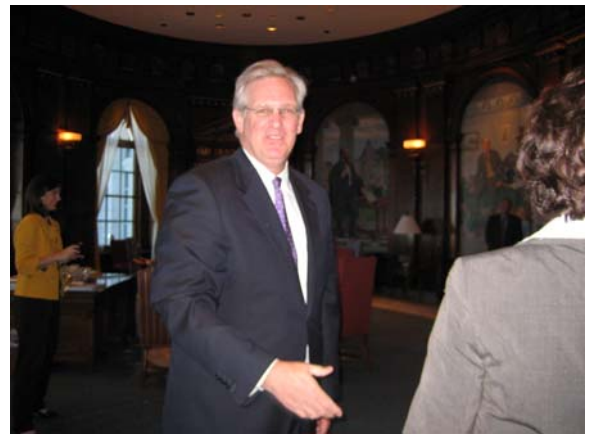
Yes, the Governor welcomed us in his office!