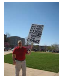
and more protestors